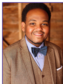
Tesfa Wondemagegnehu Mixed Choir