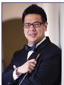
Soo Han Symphony Orchestra