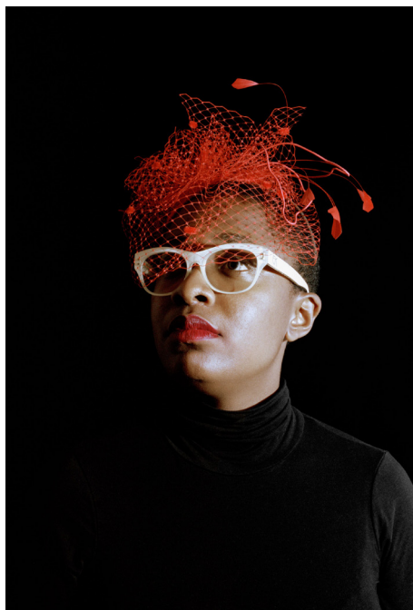
CÉCILE MCLORIN SALVANT Guest Soloist, Jazz Ensemble

Cécile McLorin Salvant, is a composer, singer, and visual artist. The late Jessye Norman described Salvant as “a unique voice supported by an intelligence and full-fledged musicality, which light up every note she sings”. Salvant has developed a passion for storytelling and finding the connections between vaudeville, blues, folk traditions from around the world, theater, jazz, and baroque music. Salvant is an eclectic curator, unearthing rarely recorded, forgotten songs with strong narratives, interesting power dynamics, unexpected twists, and humor. Salvant won the Thelonious Monk competition in 2010. She has received Grammy Awards for Best Jazz Vocal Album for her 3 latest albums, “The Window”, “Dreams and Daggers”, and “For One To Love”, and was nominated for the award in 2014 for her album “WomanChild”. In 2020, Salvant received the MacArthur fellowship and the Doris Duke Artist Award.